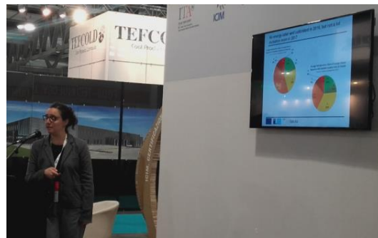
Manufacturers booth with topten logo (left) and ProCold presentation during an event co-hosted by ProCold and EFCEM (right)